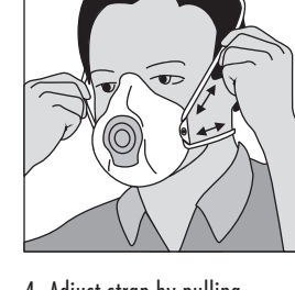
4. Adjust strap by pulling loop on strap.