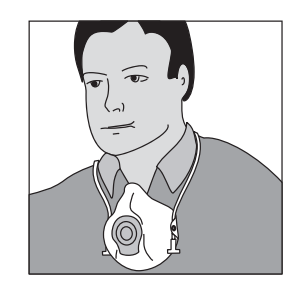
6. Let mask hang around your neck.