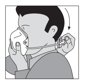
2. Place respirator on chin and pull loop over head tight to the neck.