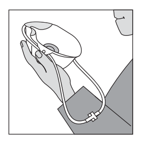
1. Pull strap to form a large loop.